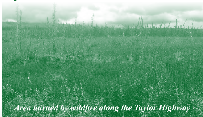
Area burned by wildfire along the Taylor Highway

Wildfires in 2004 and 2005 burned much of the spruce forest along the highway, clearing the way for new growth. As you travel the highway, notice how the area is regenerating. Pink fireweed and fresh green clumps of willows are the first plants to spring up in the blackened landscape. Cottongrass and blueberry shrubs get an infusion of nutrients from the burned forest, growing thick and lush. In some areas, birch trees are replacing the burned-over spruce in a process that will take several decades.