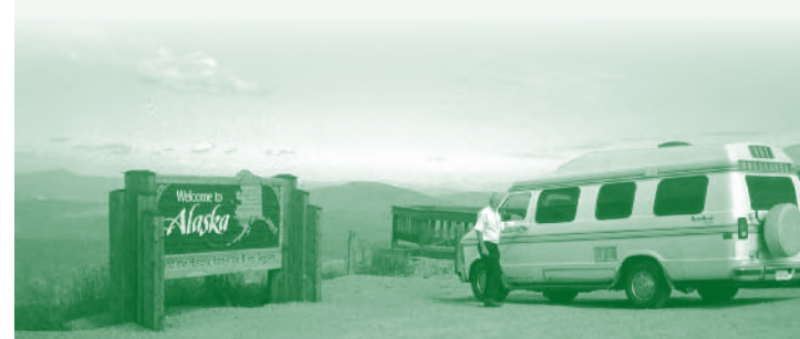
Davis Dome Wayside, Top of the World Highway

Elevation 4,127 ft (1,258 m). United States and Canada customs offices are open only during the summer months, usually from May 15 to September 15. Dates can vary so call ahead (907-774-2252) to be sure. Hours are from 8 a.m. to 8 p.m. Alaska time. The Top of the World Highway continues to historic Dawson City and the Klondike gold fields.