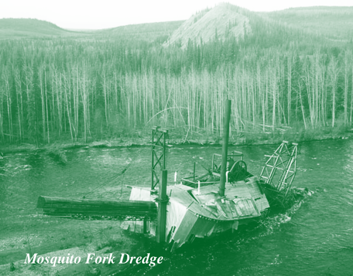
Mosquito Fork Dredge