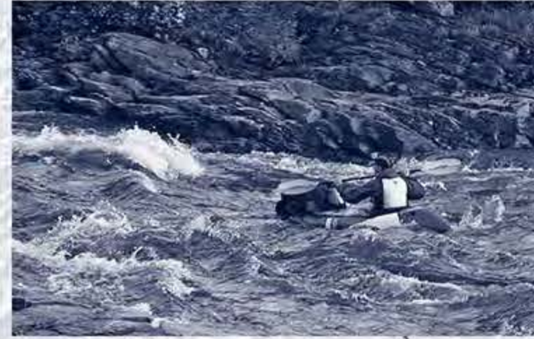
A packrafter runs a rapid on Birch Creek Wild and Scenic River.