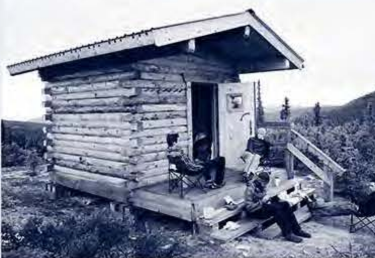
Hikers take a break at the BLM's Summit Trail Shelter in the White Mountains National Recreation Area.

Grapefruit Rocks Mile 39 (62.8 km) The large rock outcrops visible from the highway are a popular site for technical rock climbers. A short hike will bring you to the rocks. Turnouts are available for parking.