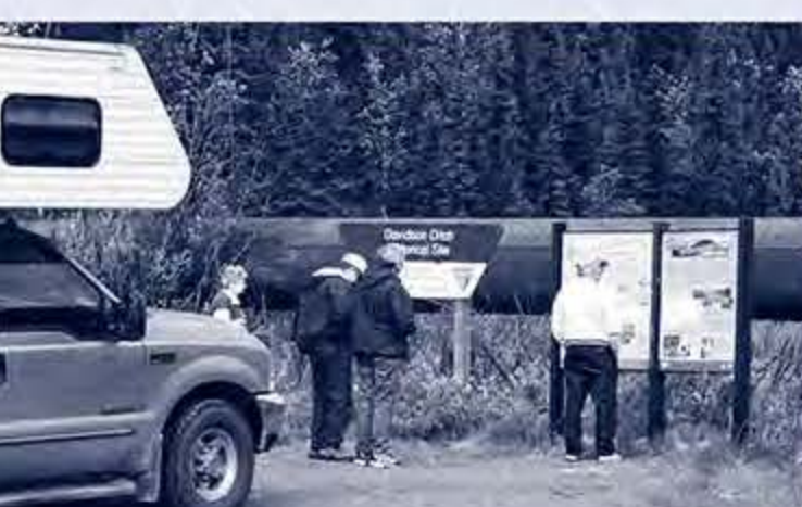
This siphon pipe at U.S. Creek (Mile 57.3) was part of the historic Davidson Ditch.

McKay Creek Trailhead Mile 42.5 (68 km) Access is provided to 200 miles of winter trails and public recreational use cabins in the 1-million-acre White Mountains National Recreation Area.