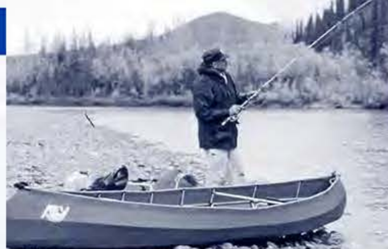
A canoeist stops to fish on Beaver Creek Wild and Scenic River.

We recommend you carry: • one or two good spare tires mounted on rims • tire jack and tool kit • emergency flares • extra gasoline, oil, and windshield cleaner • drinking water and food • emergency camping gear • first aid kit, insect repellent, and sun screen