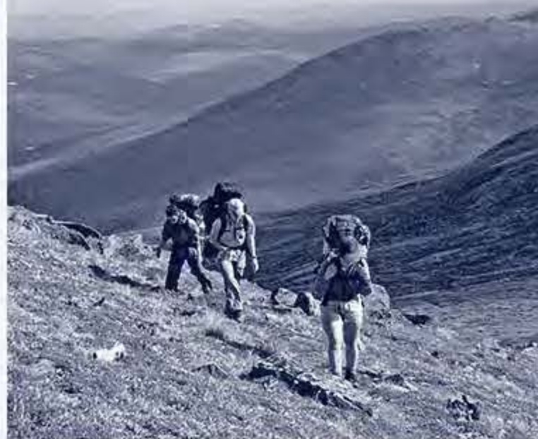
Hikers climb through tundra on the Pinnell Mountain National Recreation Trail.