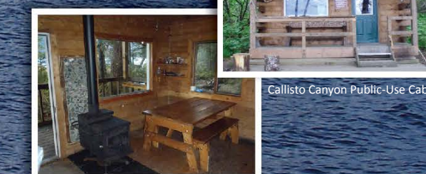
Inside the Porcupine Glacier Public-Use Cabin in Thumb Cove SMP