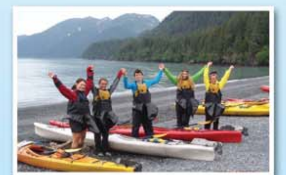
Lowell Point SRS

This park is also difficult to paddle to, as kayakers must first make the difficult trip around Cape Resurrection. Safety Cove offers somewhat better anchorage than Driftwood Bay. Wildlife viewing in the park is excellent and, on clear days, visitors may be treated to views of Ellsworth Glacier as they enter and leave the park. A three-acre lake at the head of the cove incites further exploration of this state marine park and allows for additional recreational opportunities.