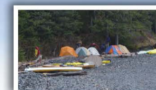
Camping at North Beach

Camping in the Resurrection Bay area state parks is a rustic backcountry experience. Each of the five state marine parks allows for beach camping. To protect fragile beach rye grass, please avoid camping on vegetated areas. Thumb Cove SMP has a toilet for kayakers and campers located on the western end of the beach, about 250 feet east of the Porcupine Glacier public-use cabin.