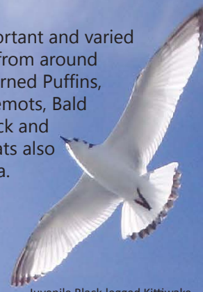
Juvenile Black-legged Kittiwake

Resurrection Bay provides important and varied bird habitat, attracting birders from around the world to see Tufted and Horned Puffins, Common Murres, Pigeon Guillemots, Bald Eagles, and Spruce Grouse. Black and brown bears and mountain goats also live in the Resurrection Bay area.