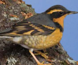
Varied Thrush (male)

Whale watching in Resurrection Bay can be very rewarding, too. Look for spouts and fins of humpback whales and orcas in the bay. Smaller marine mammals such as harbor and Dall's porpoises, sea otters, and sea lions might upstage them by putting on a show.