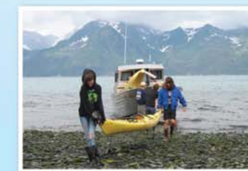
Unloading gear at Callisto Canyon Public-Use Cabin

This is a popular and particularly scenic anchorage with protected waters, impressive glaciers, and waterfalls cascading down steep rock faces. Caution is advised when boating; there are no public mooring buoys and there can be a lot of varied boat traffic. Visitors are invited to camp on the beach, or reserve one of this park's two public-use cabins. A toilet is available to boaters and campers on the west end of the beach.