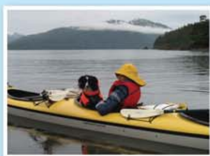
Kayaking near Callisto Canyon Public-Use Cabin