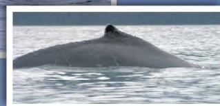
Humpback Whale near Day Harbor

Whale watching in Resurrection Bay can be very rewarding, too. Look for spouts and fins of humpback whales and orcas in the bay. Smaller marine mammals such as harbor and Dall's porpoises, sea otters, and sea lions might upstage them by putting on a show.