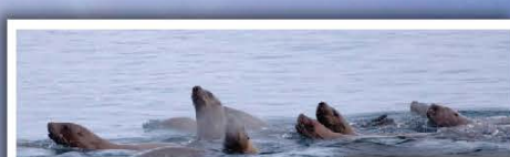
Steller Sea Lions