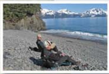
South Beach in Caines Head SRA

This trail follows another military road through the lush coastal rainforest, past ruins of the South Beach Garrison, to South Beach, a small stony beach with lots of wave action. South Beach is a great spot for pitching a tent if you want a somewhat isolated experience with great views of islands and the Gulf of Alaska. The old, rusty steel buildings are not safe to explore.