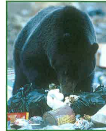
A fed bear is a dead bear! Keep a clean camp.

Bears (both black and brown bears) also frequent the area and are attracted to the fish and fish waste. Food-conditioned bears can be aggressive, and a danger to others. Bears conditioned to eating human food often return to a site again and again, and usually must be destroyed. Please use caution and keep a clean campsite.