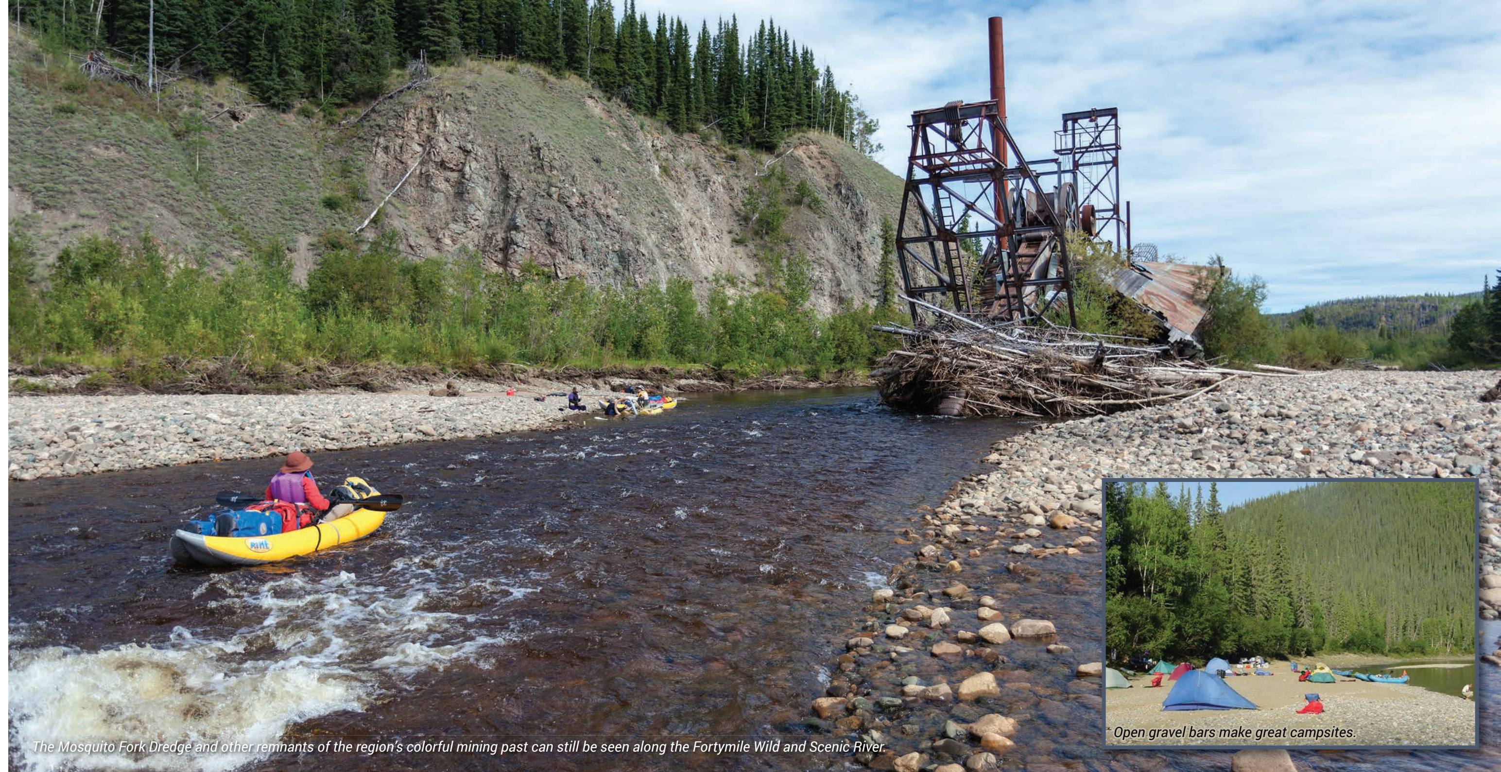
The Mosquito Fork Dredge and other remnants of the region's colorful mining past can still be seen along the Fortymile Wild and Scenic River.

Cover photo: Floating the Fortymile River near the U.S.-Canada border.