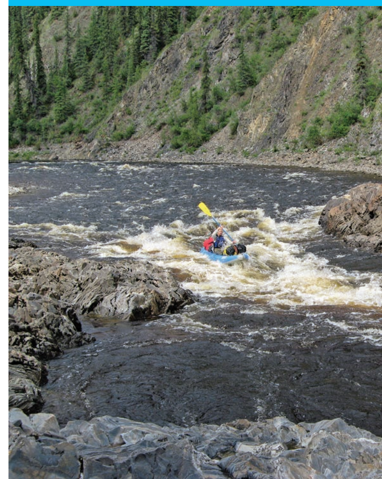
Running The Chute rapids.

there the trail wound up Steele Creek, over the ridge to Gilliland Creek, and down to the community of Jack Wade. It then headed west to Franklin and south again until it reached Chicken. The trip would take from 3 to 4 days by dog sled or horse-drawn wagon.