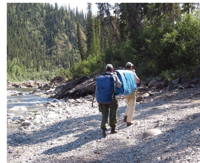
Portaging around rapids at The Kink.

Canyon Rapids is in Canada, below the mouth of Bruin Creek. Very dangerous at extremely high water, Canyon Rapids is difficult to line or portage due to the steep canyon walls. At lesser flows Canyon Rapids is class II to III water and can be lined or portaged on the right.