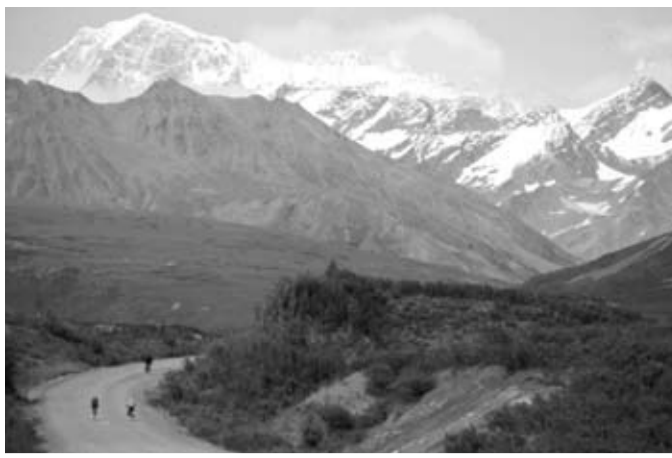
Alaska Range towers above cyclists between Paxson and Tangle Lakes.

You are driving on an esker, a sinuous ridge of silt, sand, gravel and cobbles that were carried and deposited by a stream that flowed within the